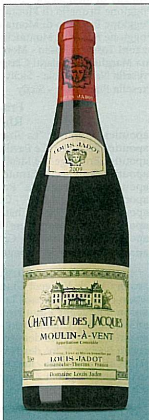
LOUIS JADOT Moulin-à-Vent Chateau des Jacques 2009 (90, $18) SMART BUY Bright; graphite, vanilla, raspberry coulis, fig, cherry

BODEGAS ITSAS-MENDI Hondarrabi Zuri Bizkaiko Txakolina 2009 (88, $18) Brisk, spritzy; savory, mineral